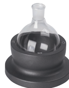
500ml Heat-On block