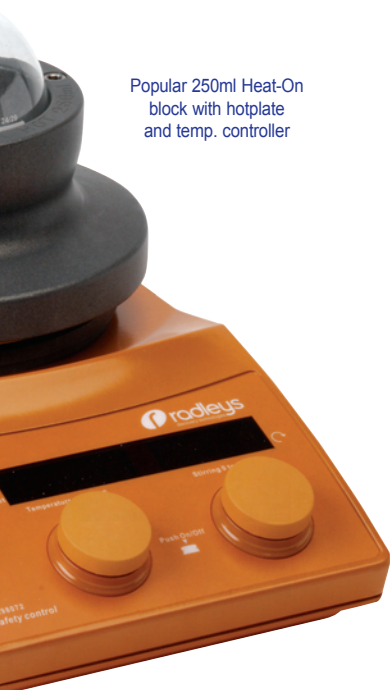
Popular 250ml Heat-On block with hotplate and temp. controller