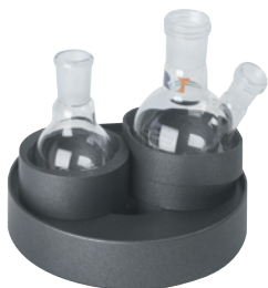
Heat-On Multi-well Block Holder with 50ml and 100ml flask inserts