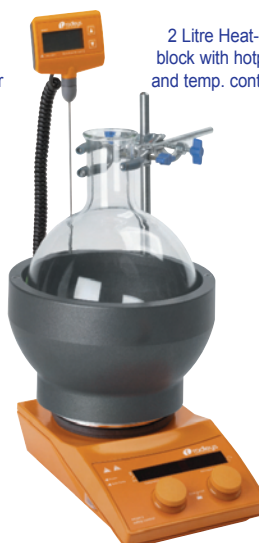
2 Litre Heat-On block with hotplate and temp. controller