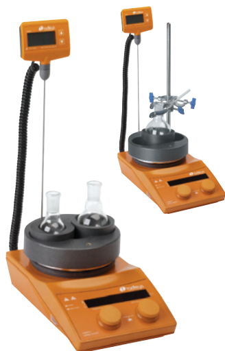
Multi-well Block Holder can accept one or two inserts as required.