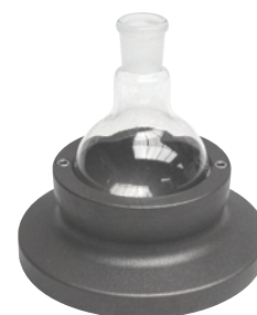
250ml Heat-On block

Each Heat-On block (250ml, 500ml, 1 litre, 2 litre, 3 litre & 5 litre) is a stand-alone product that can be placed directly onto your stirring hotplate - these blocks do not use reducing inserts to accept smaller flasks, thereby maximising heat transfer from a single piece design. All single well blocks feature two probe holes and accept the optional safety lifting handles.