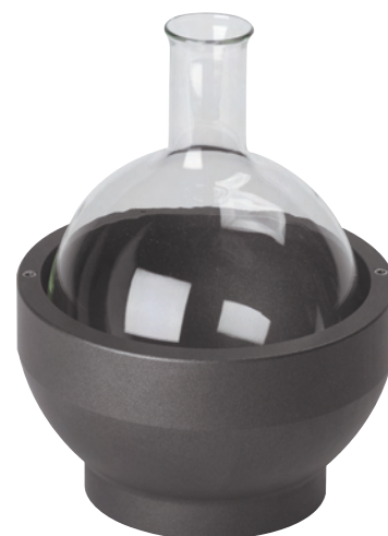
5 Litre Heat-On block