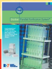
Rapid parallel purification in a 24 well titer plate footprint using standard filtration, phase separation & SPE