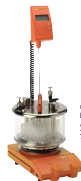
GreenHouse Blowdown Stand Alone System with 24 Well Micro Titer Plate