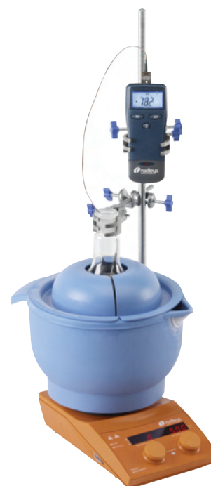
Large Cool-It bowl with lid, stirrer, stand and digital thermometer