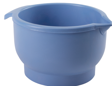
Large Cool-It bowl for flasks up to 2 litres