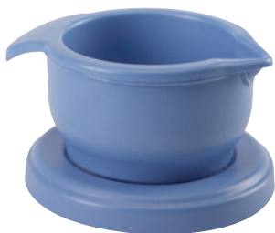
Small Cool-It bowl for flasks up to 400ml

The safest and most efficient way of cooling and stirring round bottom flasks to -78^{\circ}\text{C} .