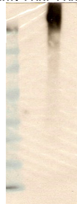
Figure 1. Western blot analysis of parylated PARP (cat# 4500-10-P). 15 µl of a 1:10 dilution of PARP-PAR in sample buffer were separated on a 4-20% Tris-Glycine SDS-PAGE gel and blotted on to PVDF membrane.

Ribosylated proteins were detected with 1:1000 dilution of anti-PAR followed by a 1:5000 dilution of HRP conjugated goat anti-mouse IgG and visualized using chemiluminescence.