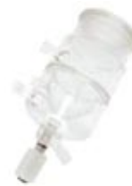
Custom 1 litre split jacketed vessel