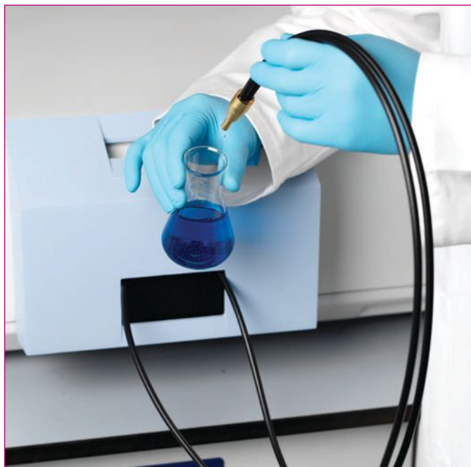
Remote Fiber-optic Accessory