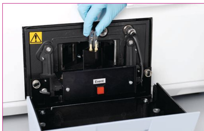
Biokinetics Accessory for LS50/45/55