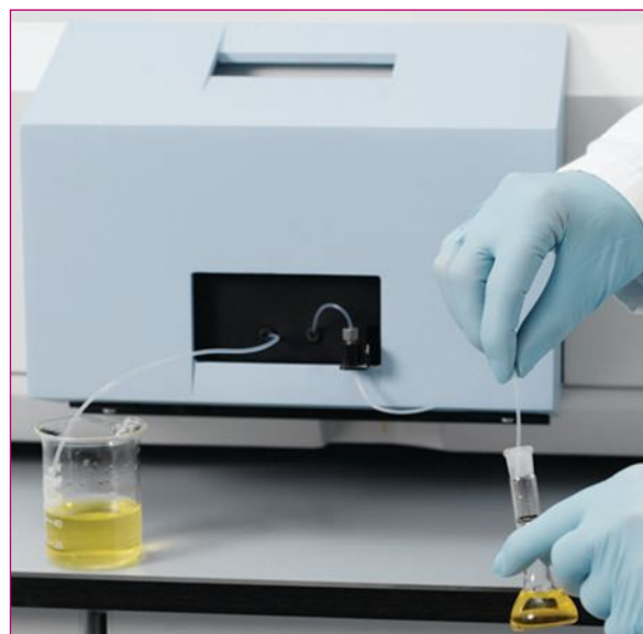
Liquid Sipper Accessory

Includes Flowcell, Peristaltic Pump, 0.4 mm FEP Inlet Tube and 0.7 mm FEP Outlet Tube. Requires installation by a PerkinElmer service engineer.