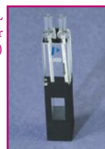
Quartz SUPRASIL Flow-through Cells for Fluorimetry (B0631126)