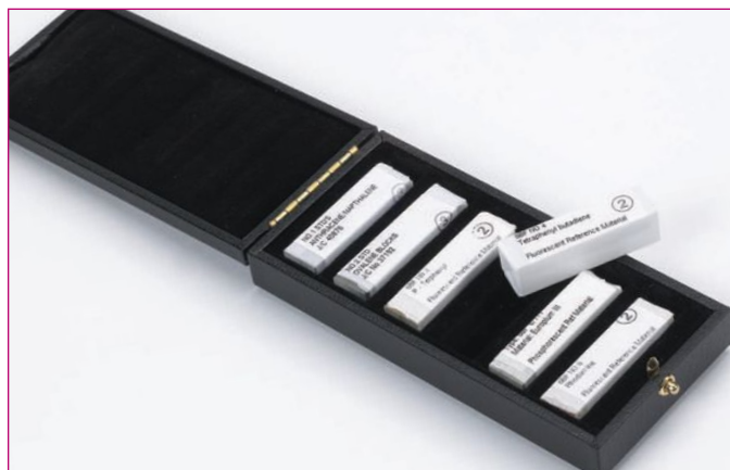
Set of six Luminescence Sample Blocks