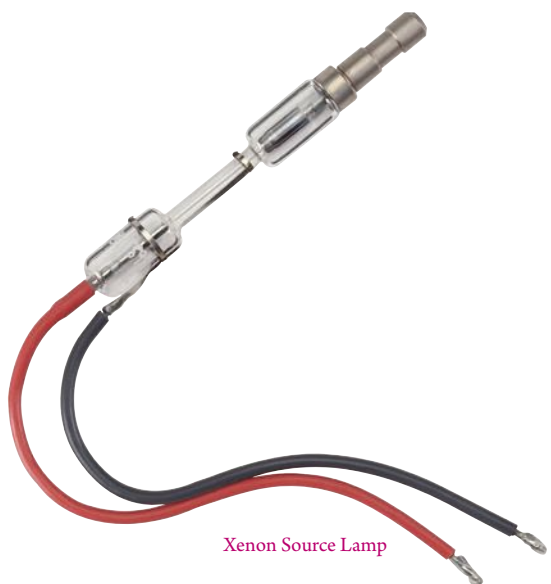
Xenon Source Lamp